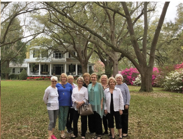
Dogwood Garden Club at Farnum Inn