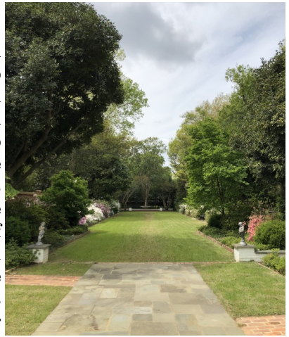
Memorial Garden Promenade