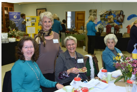
Members of Bay Blossom Garden Club.