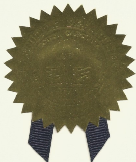
HENRY MCMASTER GOVERNOR STATE OF SOUTH CAROLINA

throughout the state and encourage all South Carolinians to recognize our gardeners for their contributions that positively impact our communities and the quality of life for our residents.