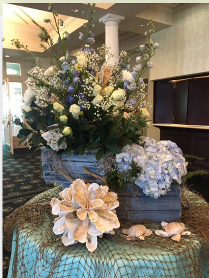
Sondra Knight's Foyer Creation