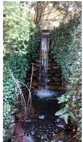
Jeff Whitwer's Waterfall

The second Camden garden viewed by members of LDCC of SC has been undergoing restoration since 1993. The original plan for this 1930's garden was hidden under a tangle of vegetation and the current owners have now discovered over 80 varieties of