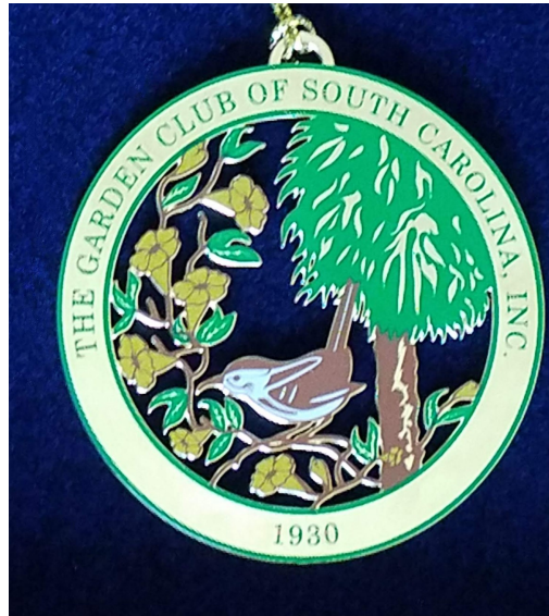
2017-2019 Commemorative Ornament