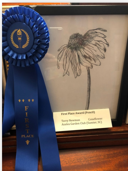
Top Right: Cone Flower Terry Newman, 1st Place Pencil