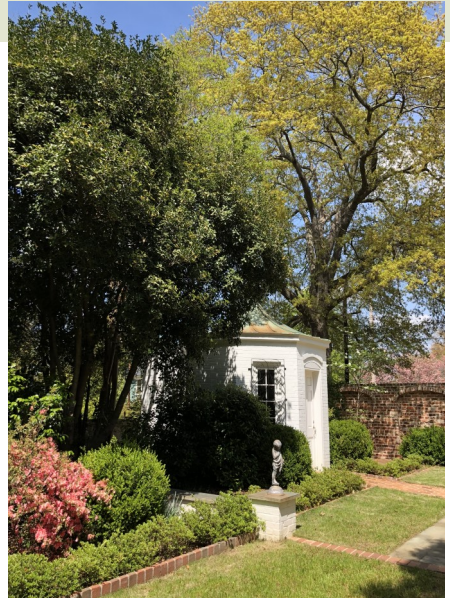
Memorial Garden Gate House

Pledge to support our Memorial Garden. Send donations to GCSC Treasurer, 701 Gervais St., Suite 150-142, Columbia, SC 29201