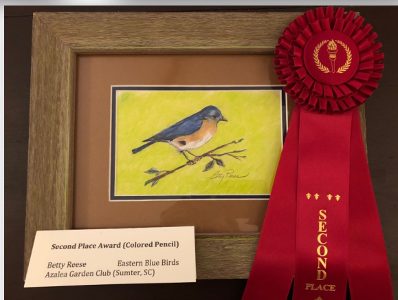
Right: Eastern Blue Bird, Betty Reese, 2nd Place Colored Pencil